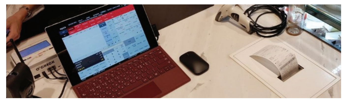
Pascucci (Korean Café) use MS Surface Pro as POS

Tablet POS is popular among restaurant and café business due to its trendy design and easy carrying. Plus, its peripheral device configuration is as same as standard POS.